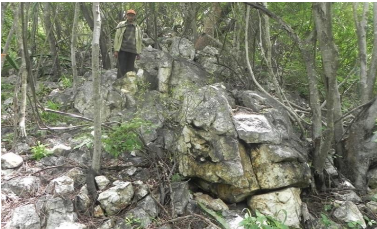
TOP: High-grade gold mineralized quartz boulders cover large areas at the Mila prospect with lines of continuous chip channel sampling of mixed outcrop and colluvium returning average grades such as 42 g/t gold along a 34 m line, and 54 g/t gold along a 24 m line of samples BOTTOM: A ridge of collapsed high-grade gold-quartz vein outcrop and boulders at the Mila prospect which returned an average of 95 g/t gold across a 10 m width from 2 m chip channel samples of outcrop and boulder float.