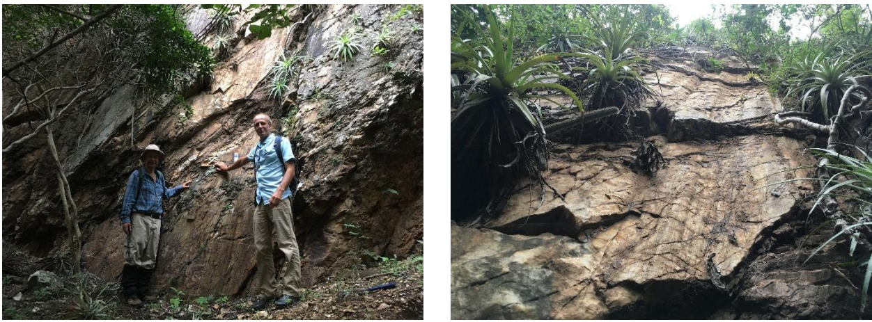
The Veta Madre Fault vein exposed in a 20-30 m cliff immediately west of the Mila bonanza-grade quartz boulder colluvium field. At this locality the Veta Madre Fault dips steeply to the north and bears fluting and slickensides indicating dip-slip movement.

sericite altered and micro-veined schist with samples returning assay results of up to 94 g/t gold, indicating potential for significant wall rock mineralization.